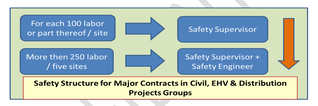
Annexure 3.6 (Refer Para 4.0)